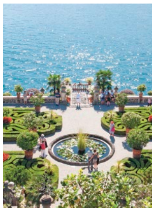
Isola Bella, Lake Maggiore