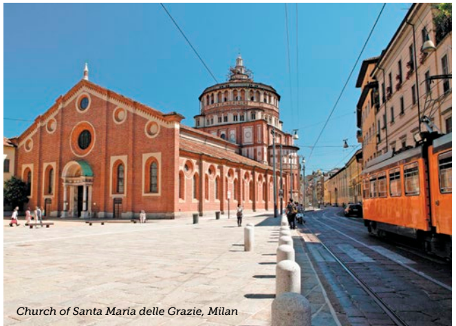
Church of Santa Maria delle Grazie, Milan