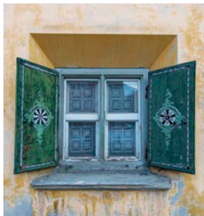
Charming Engadine architecture