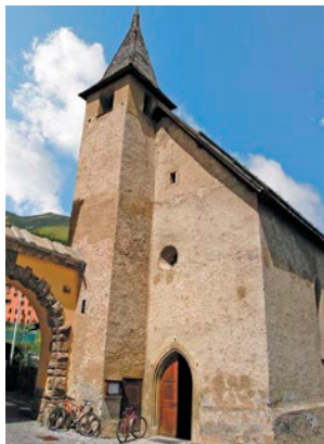
Old church, Zuoz