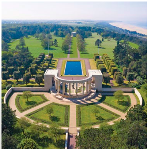
Normandy American Cemetery

AHI Connects | Calvados. Normandy's apple cider brandy is among the world's finest brandies. Visit an estate that distills Calvados