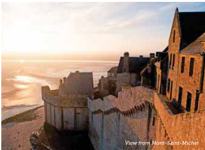
View from Mont-Saint-Michel