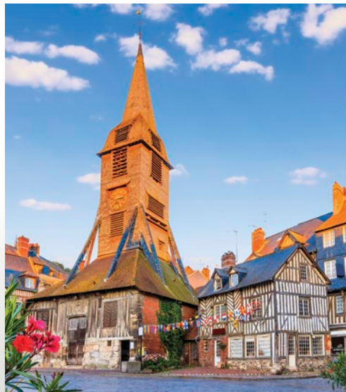
Church of Sainte Catherine, Honfleur

a wonder of the Western world. Take a guided tour of this intriguing tidal island and step inside the tranquil abbey and church that have drawn pilgrims for centuries. (Active)