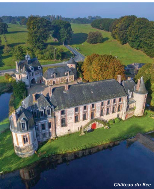
Château du Bec