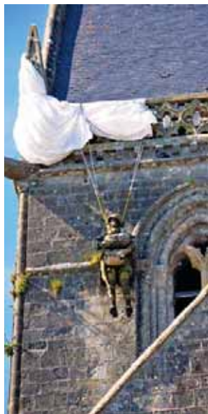
Private John Steele Monument, Sainte-Mère-Église

Knowledgeable Lecturers deepen your appreciation for the region and its history, culture and current events.