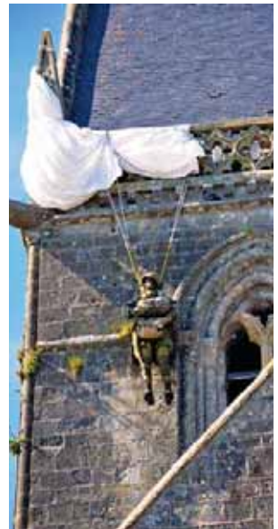
Private John Steele Monument, Sainte-Mère-Église

Knowledgeable Lecturers deepen your appreciation for the region and its history, culture and current events.