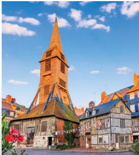
Church of Sainte Catherine, Honfleur

Free Time: Select a special place for dinner. Your Travel Director can assist with planning.