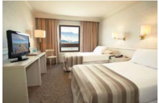
Hotel Costaustralis | Puerto Natales