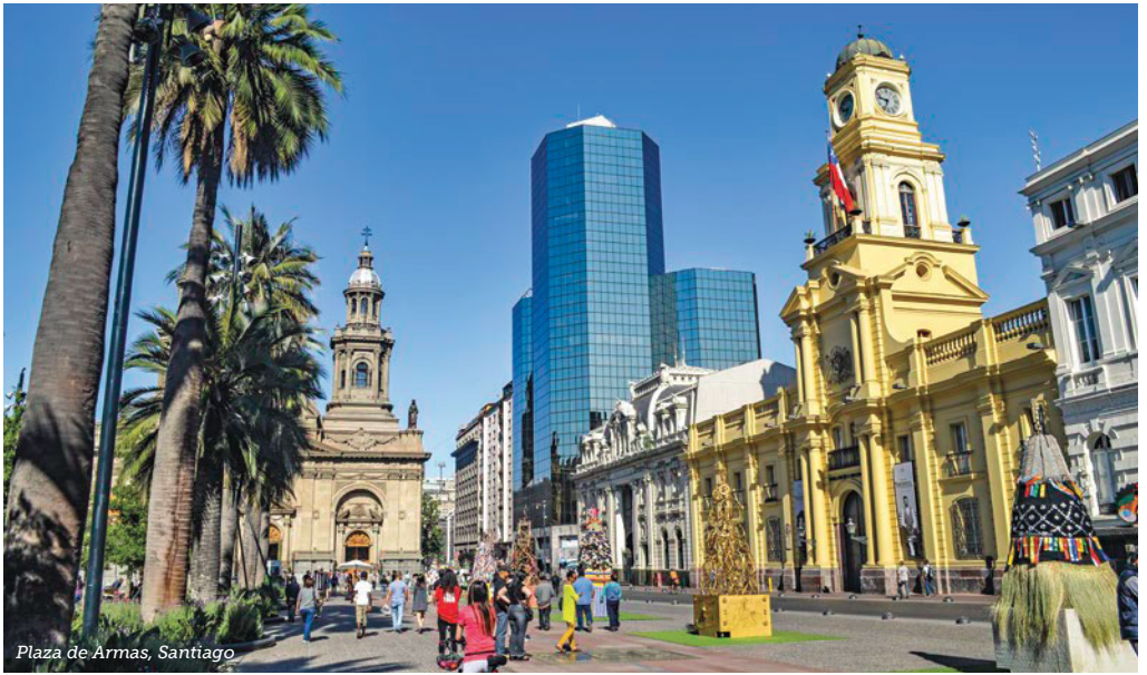
Plaza de Armas, Santiago