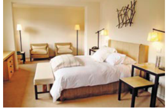
Enjoy Puerto Varas Hotel | Puerto Varas