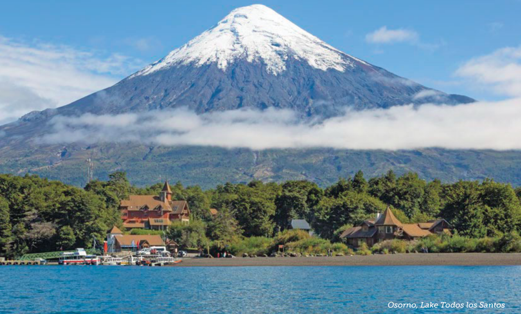
Osorno, Lake Todos los Santos