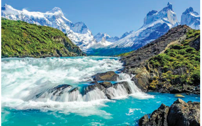
Salto Grande waterfall, Torres del Paine National Park