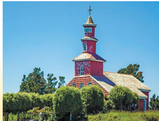
Wooden church, Chacao, Chiloé Island

Petrohué River Falls. Breathtaking scenery is the star attraction today within Vicente Pérez Rosales National Park. Admire the rushing, turquoise waters of the falls and then navigate by boat through stunning Lake Todos los Santos surrounded by the impressive, snowcapped Osorno, Puntagudo and Tronador volcanoes.