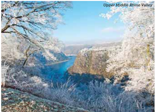
Upper Middle Rhine Valley