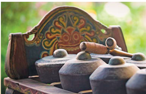
Left: Balinese gamelan | Below: Beaded baskets, market, Ubud

Multicultural Singapore. Uncover Singapore's diverse cultures and rich history. Drive through Kampong Glam, a Malay enclave that originated as a fishing village. Explore Chinatown and Little India's vibrant flower and exotic spice markets.