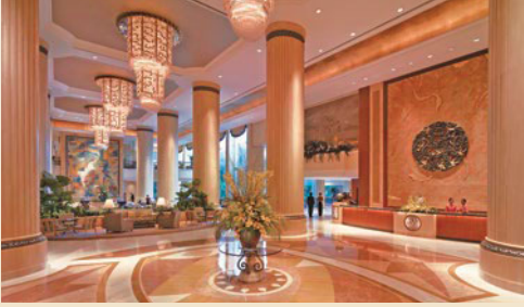
Shangri-La Singapore | Singapore