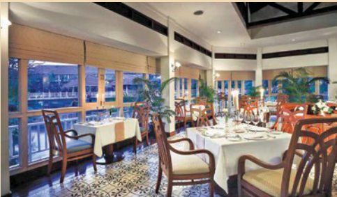
Sofitel Angkor Phokeethra Golf and Spa Resort | Siem Reap