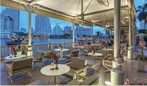
The Peninsula Bangkok | Bangkok