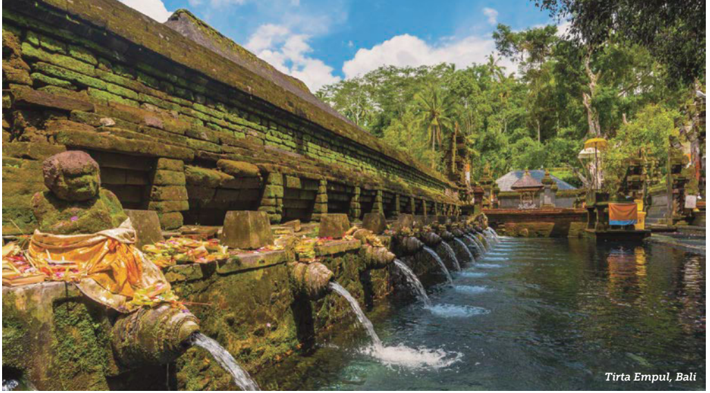
Tirta Empul, Bali