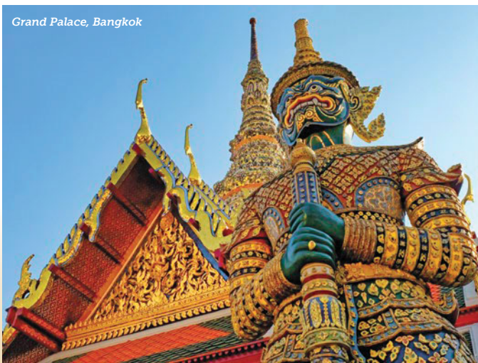
Grand Palace, Bangkok