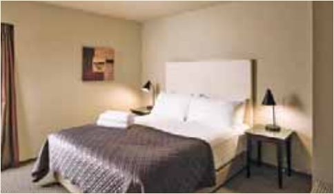
Carmore Chateau Marlborough | Blenheim ●●●●●