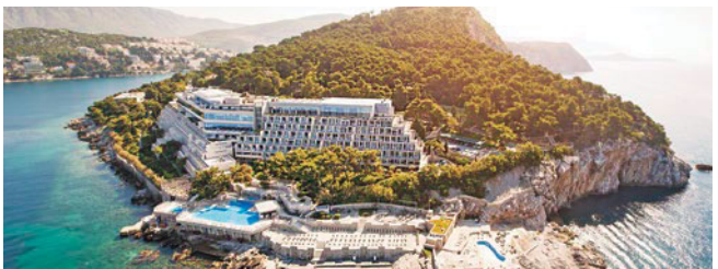
Dubrovnik Palace | Dubrovnik