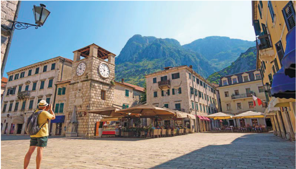
Kotor's Old Town

Depart gateway city for Dubrovnik, Croatia. 🌐