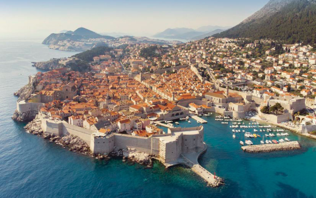
Walled city of Dubrovnik

brandy. Tour the company's Šipčanik wine cellar, located in a former underground Yugoslav-era aircraft hangar. Learn about the region's unique microclimates and grape varieties and sample Montenegrin wines.