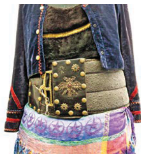
National Museum of Montenegro, Cetinje

Knowledgeable Lecturers deepen your appreciation for the region and its history, culture and current events.