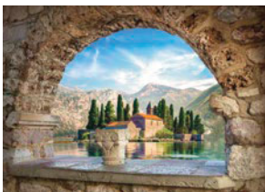
View of Island of Saint George from the Church of the Lady of the Rocks