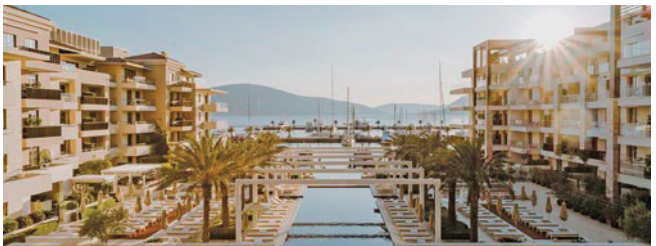
Regent Porto Montenegro | Tivat