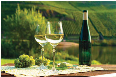
Moselle white wine