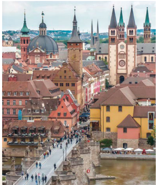
Old Town, Würzburg