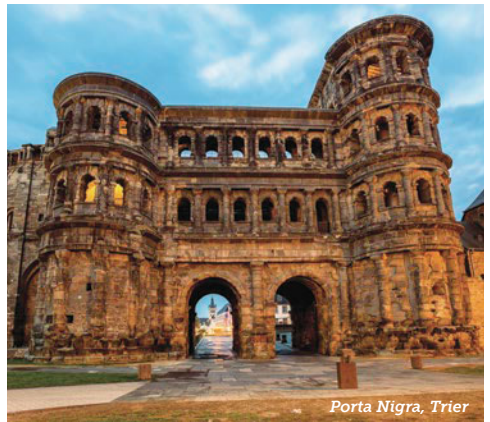
Porta Nigra, Trier