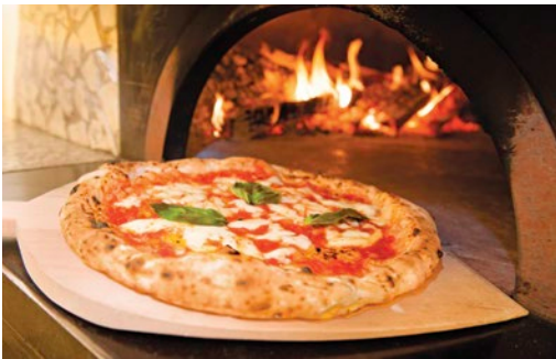
Above: Neapolitan pizza | Below: Olive oil & cheese