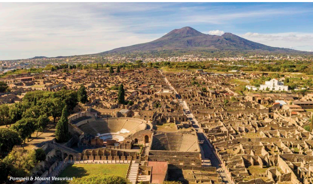
Pompeii & Mount Vesuvius

Nuovo, San Francesco di Paola, Teatro di San Carlo and Piazza del Plebiscito.