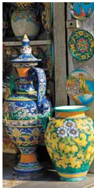
Pottery, Vietri sul Mare

Knowledgeable Lecturers deepen your appreciation for the region and its history, culture and current events.