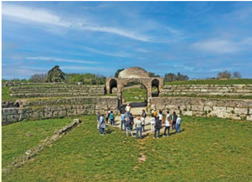
Below: Amphitheater, Paestum | Above: Amalfi

Naples & the Museo Archeologico Nazionale. Energetic Naples, the capital city of Campania, welcomes visitors with a vivacious spirit. Gain insight into the ancient world at the Museo Archeologico Nazionale. The museum's galleries boast one of the largest collections of Greco-Roman artifacts in the world. Continue on a panoramic tour of Naples, taking in sprawling views of the city and the Bay of Naples from atop Posillipo Hill. Note the landmarks of Castel