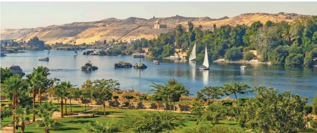
Feluccas sailing on the Nile River near Aswan

Abu Simbel. Visit the majestic Great Temple of Ramses II, which commemorates triumphs over the Nubians, Hittites and Syrians, and the temple dedicated to the goddess Hathor.