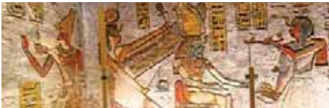
Hieroglyphics, Valley of the Kings