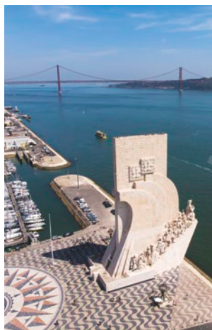
Monument to the Discoveries, Lisbon