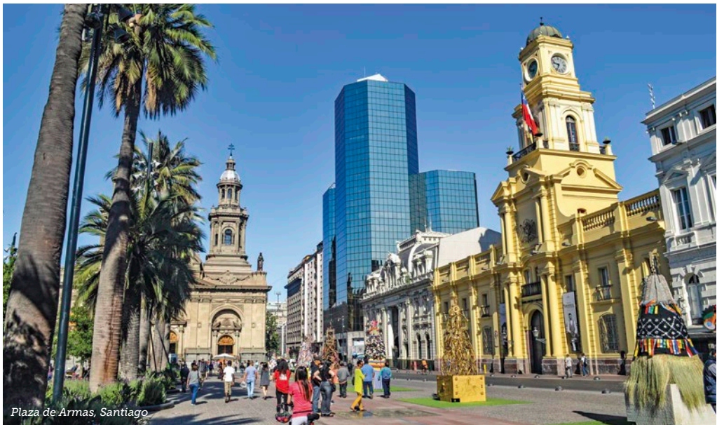
Plaza de Armas, Santiago