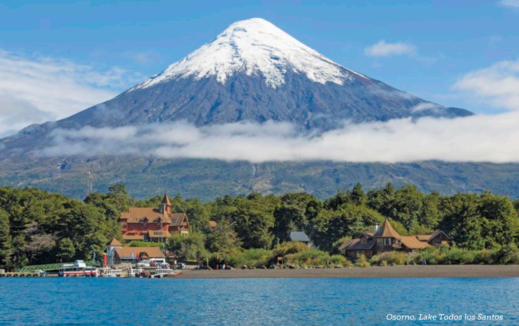
Osorno, Lake Todos los Santos