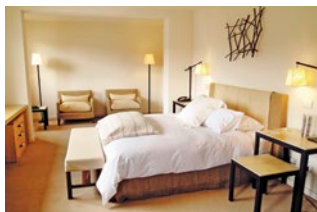
Enjoy Puerto Varas Hotel | Puerto Varas