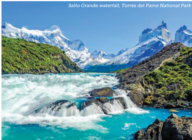
Salto Grande waterfall, Torres del Paine National Park