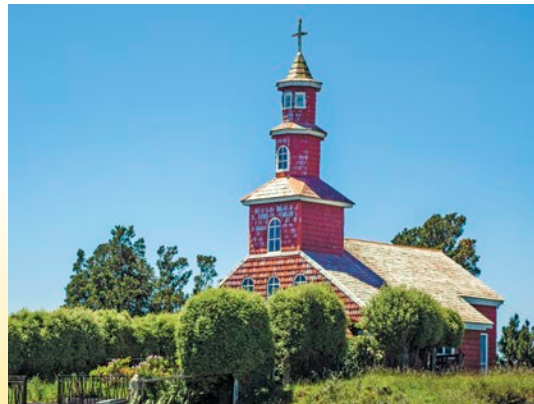
Wooden church, Chacao, Chiloé Island

Petrohué River Falls. Breathtaking scenery is the star attraction today within Vicente Pérez Rosales National Park. Admire the rushing, turquoise waters of the falls and then navigate by boat through stunning Lake Todos los Santos surrounded by the impressive, snowcapped Osorno, Puntagudo and Tronador volcanoes.