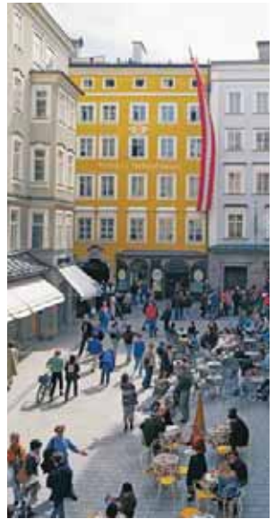
Mozart's Birthplace, Salzburg