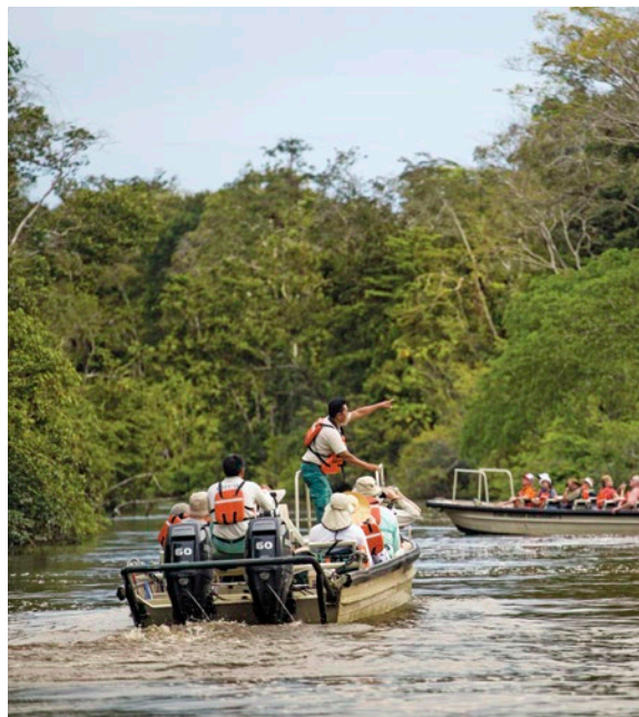
Cruising the Amazon Basin aboard skiff boats

From magnificent Inca ruins to sophisticated Lima and the lush Amazon Basin, explore the richness of Peru! Delight in a luxury cruise through the Amazon rain forest and discover the astonishing diversity of its wildlife on guided skiff boat rides and jungle hikes. In the Sacred Valley and Cusco, delve into Peru's remarkable Inca heritage, and ride by train through the Andes to explore the temples, palaces and plazas of magical Machu Picchu!