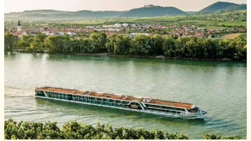
MS Amadeus Queer