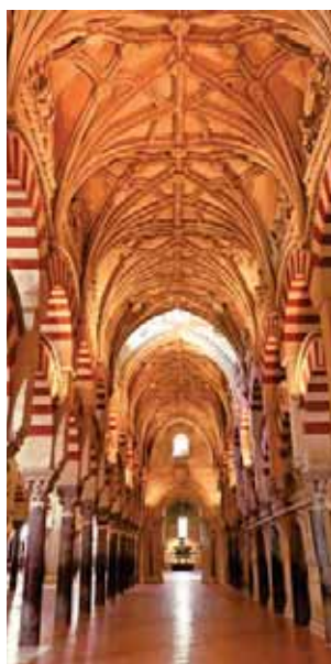
La Mezquita, Córdoba

Knowledgeable Lecturers deepen your appreciation for the region and its history, culture and current events.