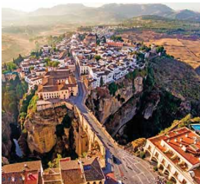
El Tajo Gorge, Ronda