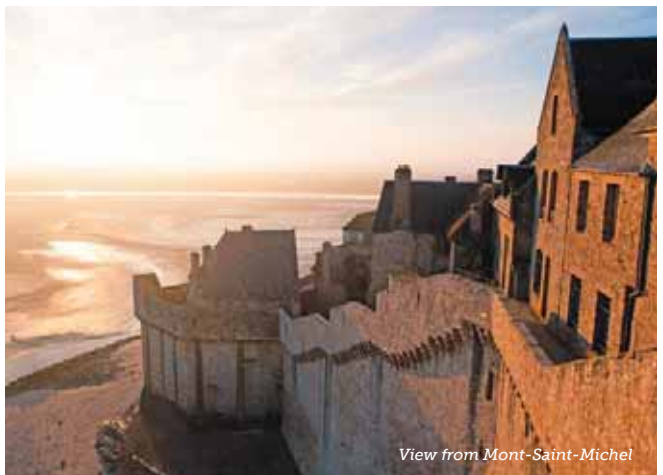
View from Mont-Saint-Michel