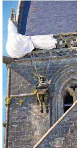
Private John Steele Monument, Sainte-Mère-Église

Knowledgeable Lecturers deepen your appreciation for the region and its history, culture and current events.