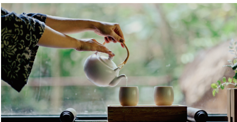
Top: Haedong Yonggungsa Temple | Above: Tea ceremony