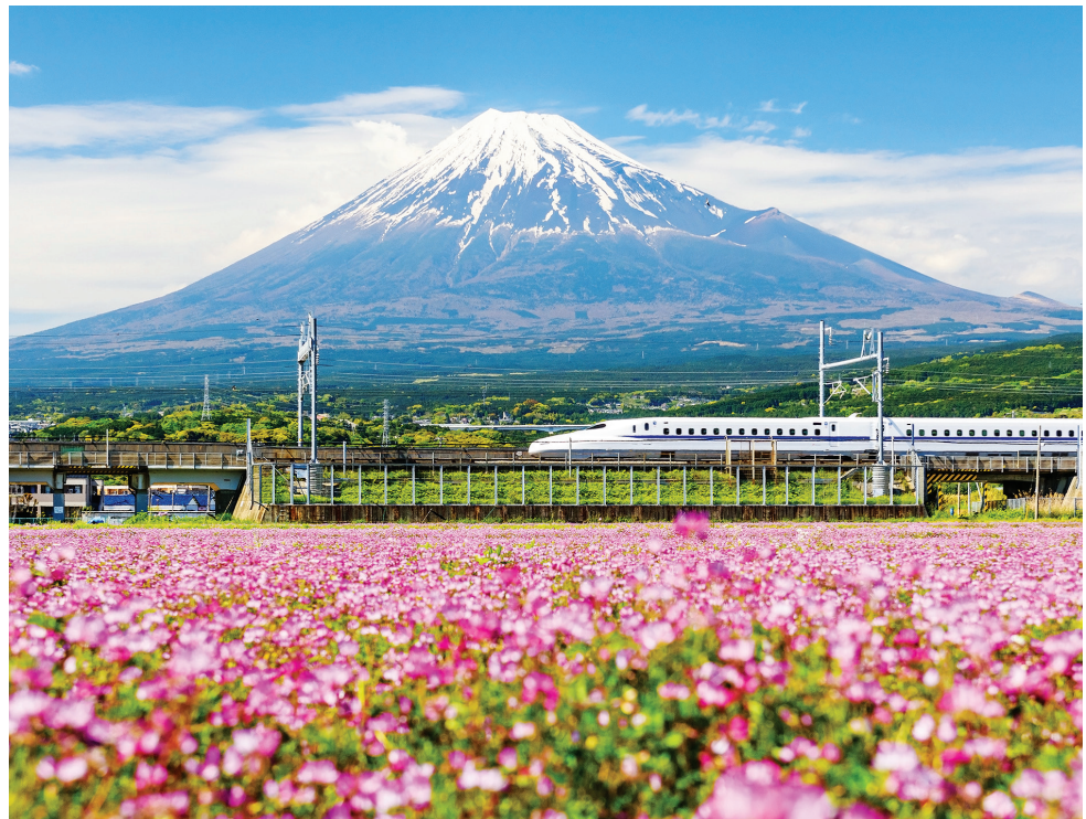
Shinkansen passing Mt. Fuji

Tokyo. Drive through the chic, stylish Ginza shopping district. Witness Tokyo Skytree, the world's tallest building. Visit the colorful, Buddhist Asakusa Kannon Temple. Explore the Imperial Palace's exquisite gardens.