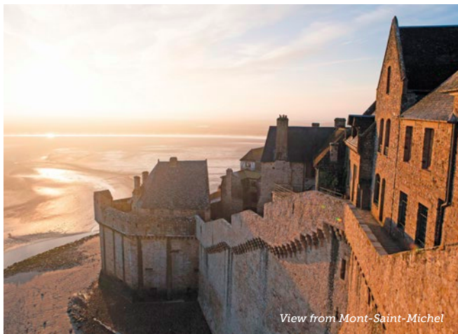
View from Mont-Saint-Michel