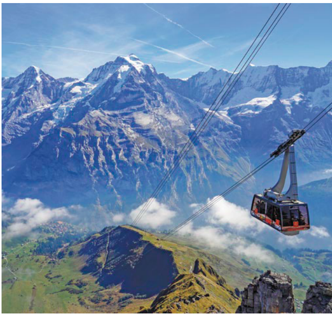
Spectacular views from cablecar to Schilthorn