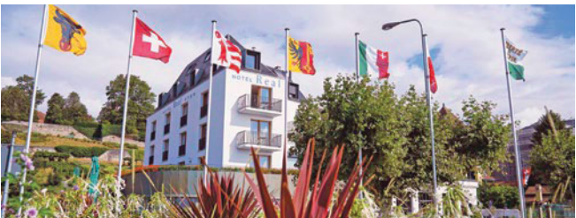
Hotel Real Nyon | Nyon