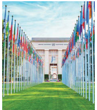
Palace of the Nations, Geneva

Knowledgeable Lecturers deepen your appreciation for the region and its history, culture and current events.