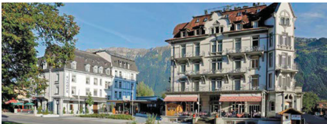
Hotel Carlton-Europe | Interlaken