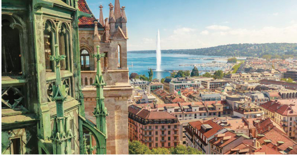
Jet d'Eau, Geneva

AHI Connects | Swiss Cheese. Visit a countryside dairy farm. Watch a demonstration on making handmade Gruyère cheese and sample this decadent product.