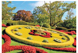
Flower clock, Geneva