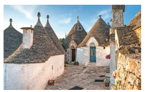
Top: Polignano a Mare | Above: Trullo