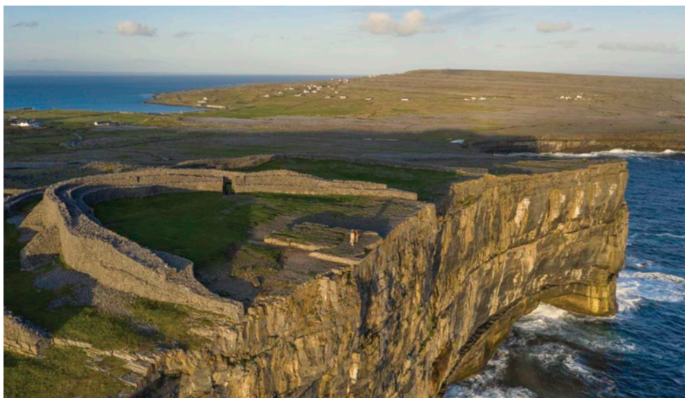
Dun Aengus, Inishmore