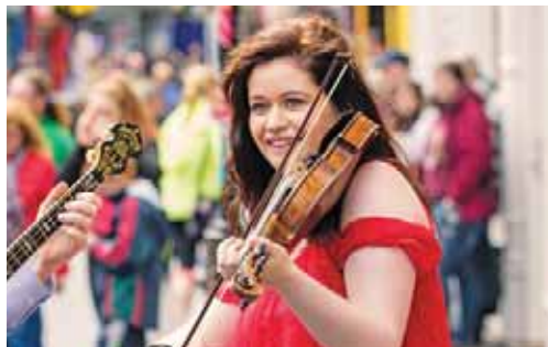
Top: Kylemore Abbey | Above: Musician

Aran Island of Inishmore. Ferry across Galway Bay to the largest of the Aran Islands. As you travel on a minibus, your local guide will share entertaining stories about life on this stark, arresting island, where Gaelic is the first language. See cliffside Dun Aengus, the most famous of the Aran Islands' Bronze Age forts, and pause for lunch before your return ferry.