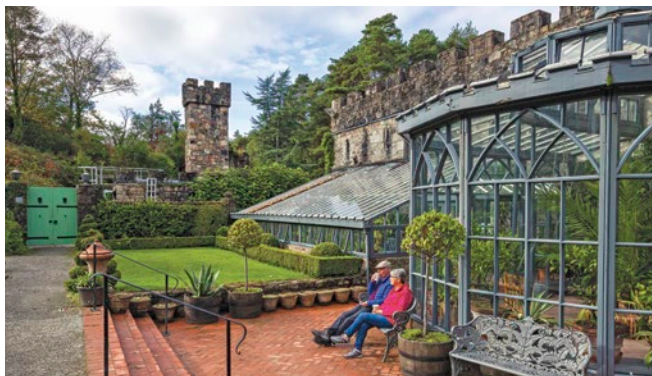
Glenveagh Castle, Glenveagh National Park