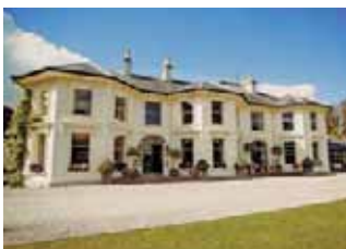
Rathmullan House | Rathmullan