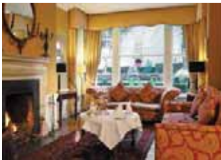
Old Ground Hotel | Ennis