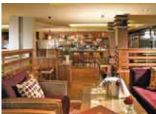
Westport Plaza Hotel | Westport