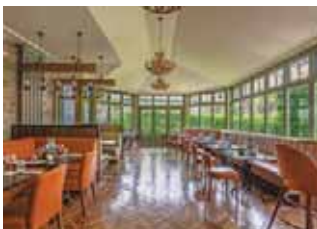
The Lodge at Castle Leslie Estate | Glaslough