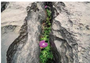
Flora among the limestone, Burren