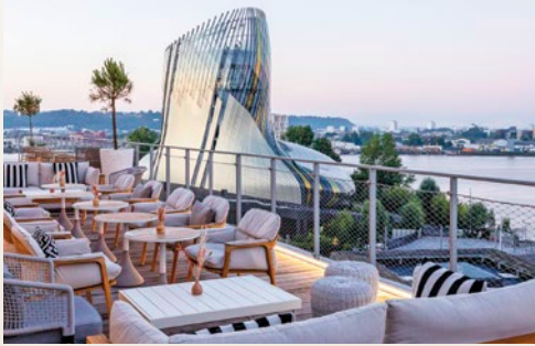
Renaissance Bordeaux Hotel | Bordeaux

Our travel experts have carefully chosen these first-class hotels for their prime locations and historic character. The chic Renaissance Bordeaux in the trendy Old Docks area features a dramatic entrance from transformed grain silos, while the elegant Catalonia Donosti, housed in a former 18th-century convent, offers amazing city views. Of utmost importance is the superior quality of their services, amenities and accommodations, allowing you to enjoy your stay fully.