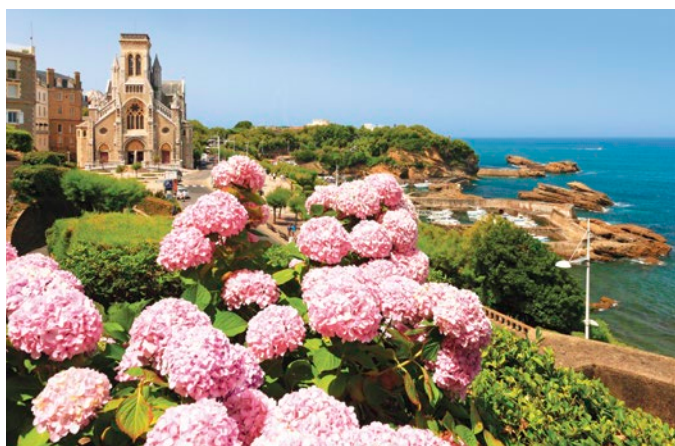
St. Eugénie Church, Biarritz