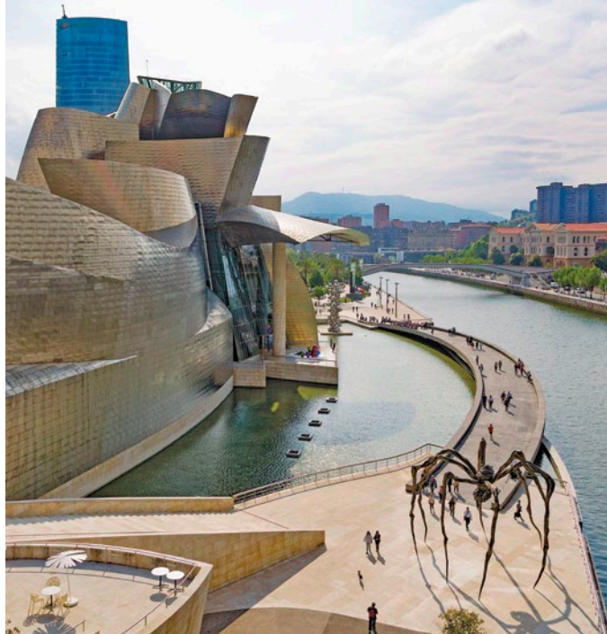
Guggenheim Museum, Bilbao