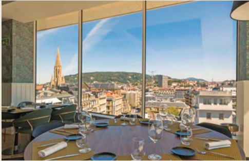
Catalonia Donosti Hotel | San Sebastián