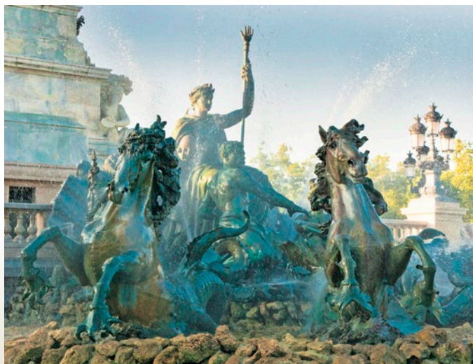
Fountain, Place des Quinconces, Bordeaux