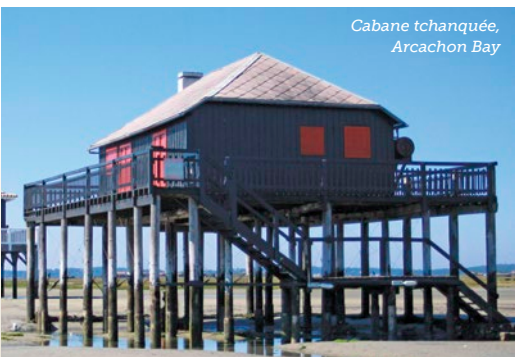
Cabane tchanquée, Arcachon Bay

San Sebastián. Called Donostia in Basque, San Sebastián became known as a resort town when Queen Isabella II chose it as her summer seaside retreat in the mid-1800s. Spanish royalty and aristocrats followed, and the city expanded with grand Belle Époque buildings. See its highlights, including the 18th-century, baroque Basilica de Santa María del Coro , on a guided walk through the buzzing old town and along the waterfront promenade by spectacular La Concha Bay.