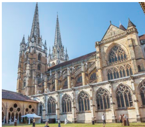
Cathedral of Saint Mary of Bayonne, Route of Santiago de Compostela