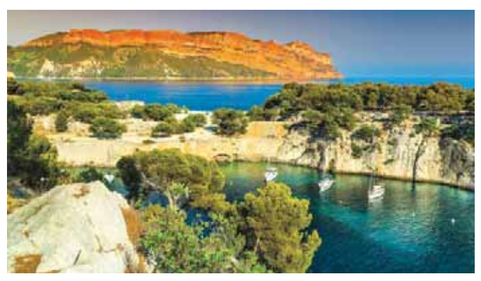
Calanques of Marseille near Cassis