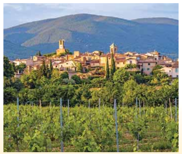
Lourmarin, The Luberon