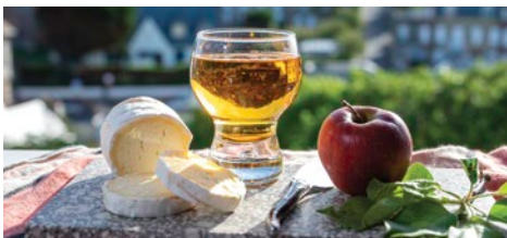
Top: Mont-Saint-Michel | Above: Calvados brandy