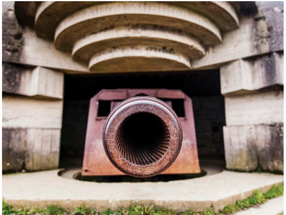
Barrel of a cannon, Omaha Beach

Honfleur. Craft your own itinerary during a full day at leisure in this picturesque coastal town, immortalized in paintings by Claude Monet. Stroll among the vendors on market days, situated around the great wooden Church of St. Catherine, wander its medieval cobblestone streets and admire timbered houses along the historic harbor.