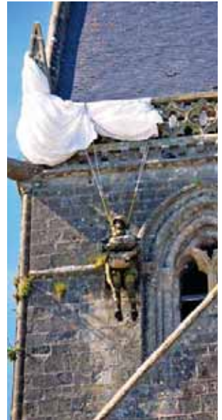
Private John Steele Monument, Sainte-Mère-Église

Knowledgeable Lecturers deepen your appreciation for the region and its history, culture and current events.