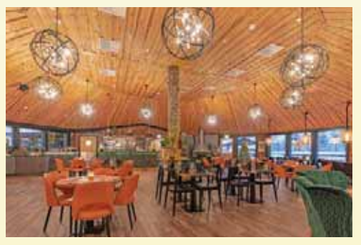
Northern Lights Village | Saariselkä