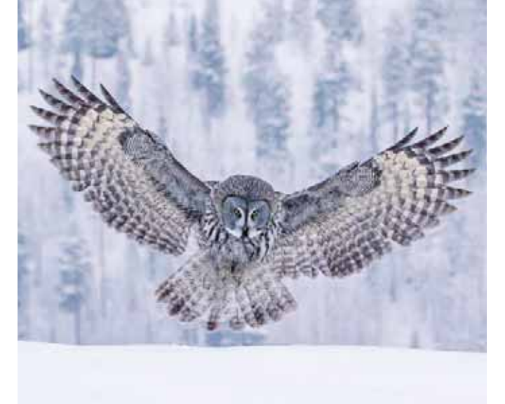
Great Grey Owl, Lapland