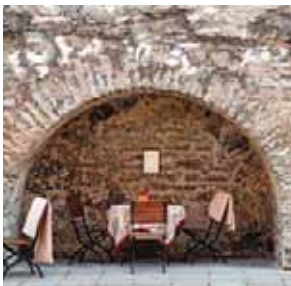
Old Town, Tallinn

Historic Center (Old Town) of Tallinn, Estonia