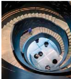
Oodi Library, Helsinki