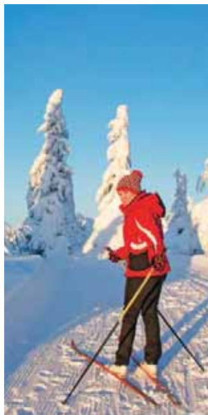
Exploring at Northern Lights Village