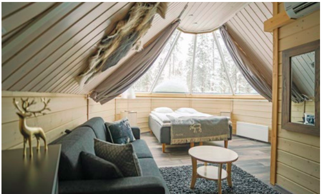
Northern Lights Village | Saariselkä