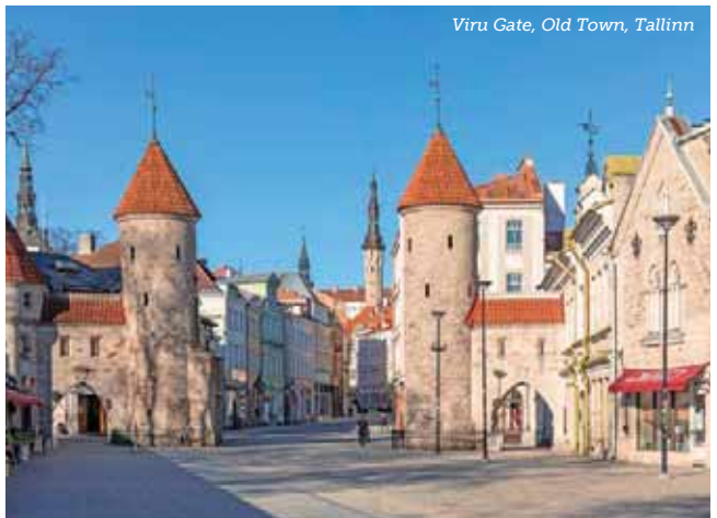
Viru Gate, Old Town, Tallinn