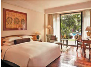
Sofitel Angkor Phokeethra Golf & Spa Resort | Siem Reap, Cambodia