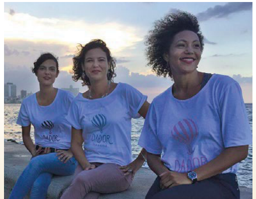
Founders and owners of Dador

Jewish Culture & Cuban Dance. Visit the Ashkenazi Community Center to learn about Cuba’s Jewish culture. Then, stop at Malpaso, a contemporary dance studio, to spend time with the dancers and gain insight into their