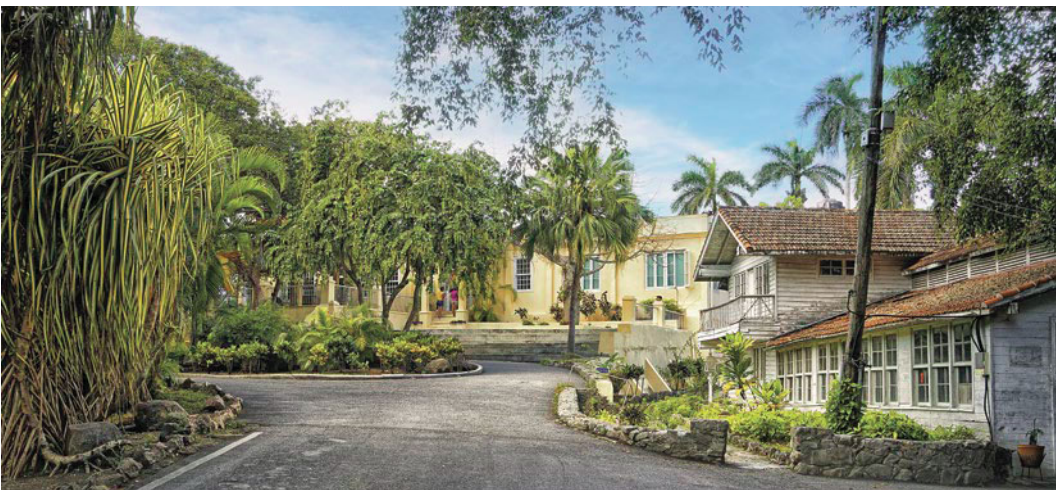
La Finca Vigía, Ernest Hemingway's home & museum

passion, training and dedication to dance.