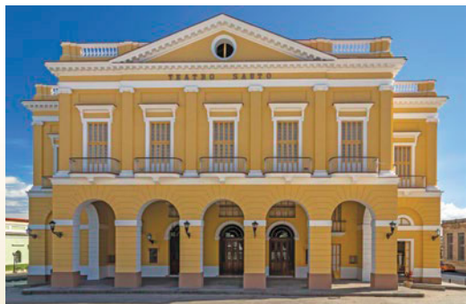
Sauto Theater, Matanzas