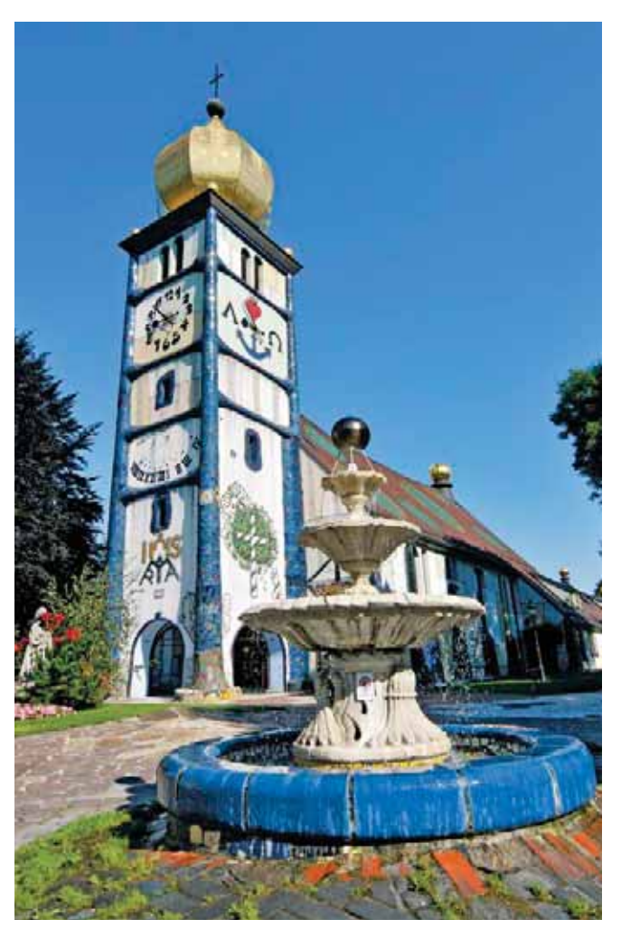
St. Barbara Church, Bärnbach