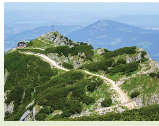
Eagle's Nest, Mount Kehlstein