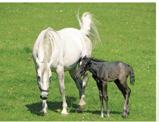
Lippizaner mother & foal

Free Time: Explore the area a bit and choose among the wide selection restaurants in Salzburg, from refined contemporary or classical Austrian cusines to casual fare at a café or beer garden.