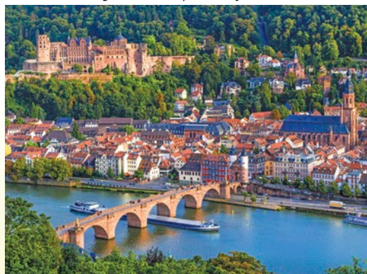
View of Heidelberg from Philosopher's Way

• Speyer Walking Tour. Take a guided stroll in the historic area of one of Germany's oldest cities. Admire the stately Romanesque cathedral, the burial place of emperors for almost 300 years; the 13th-century Old Gate and other notable sites.