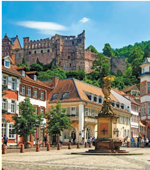
Heidelberg Castle above the historic old town