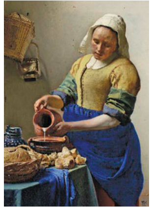
Detail of "The Milkmaid," Johannes Vermeer, Rijksmuseum