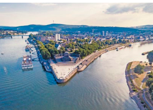
Koblenz, where the Rhine & Moselle Rivers meet

The ship cruises overnight toward Mannheim.