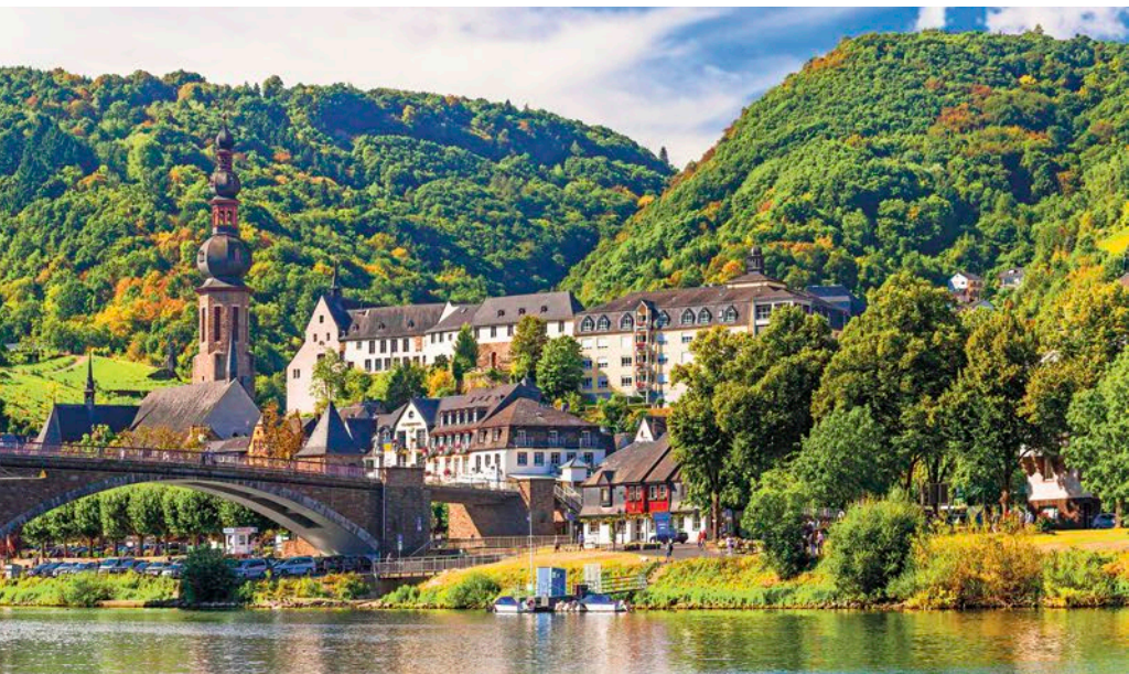
Cochem & Reichsburg Castle on the Moselle River

Koblenz. Koblenz, founded more than 2,000 years ago, sits at the confluence of the Moselle and Rhine rivers. Take a guided walk along the old town's lanes and see the Church of Our Lady, the Jesuitenplatz and other highlights.