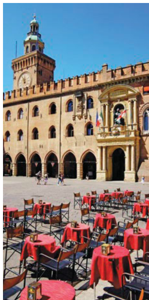
Piazza Maggiore, Bologna