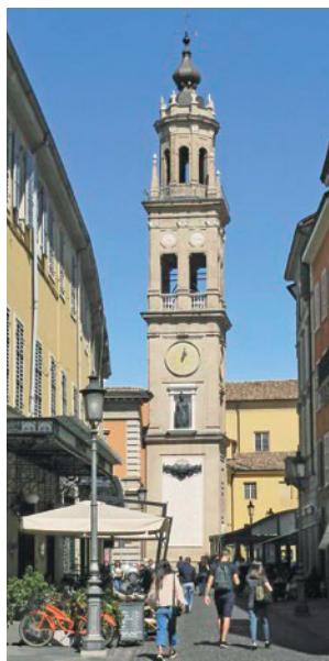
Clock tower, Parma

Knowledgeable Lecturers deepen your appreciation for the region and its history, culture and current events.