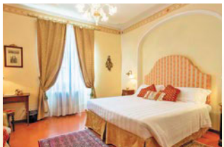
Villa Marsilli | Cortona