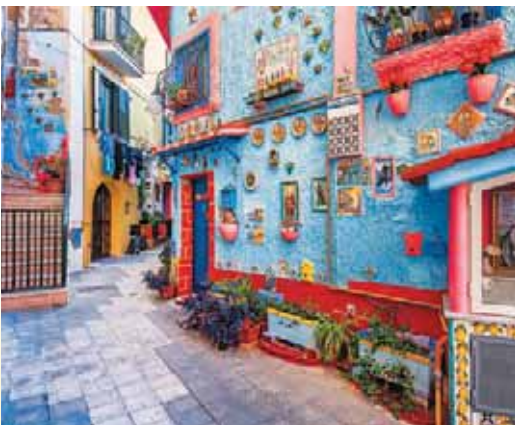
Colorful alleyways of Vietri sul Mare

Enrichment: The Horror and Splendor of Mount Vesuvius. Learn about the tragic effects of the eruption of Mount Vesuvius. This compelling talk provides context for tomorrow's visit to Herculaneum and Pompeii.