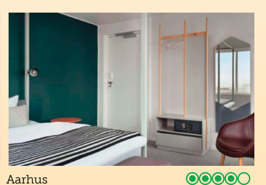
Comwell Aarhus — Dolce by Wyndham | Aarhus