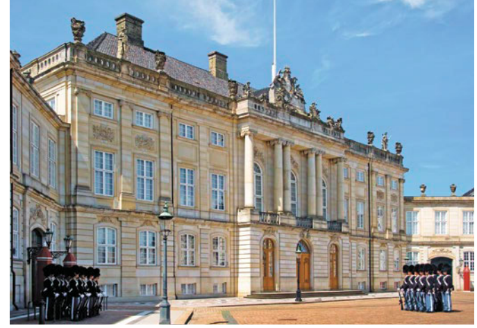
Amalienborg Palace, Copenhagen