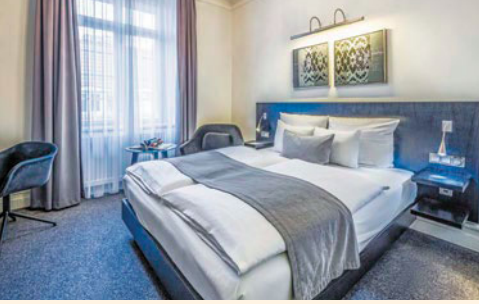
Scandic Palace Hotel | Copenhagen