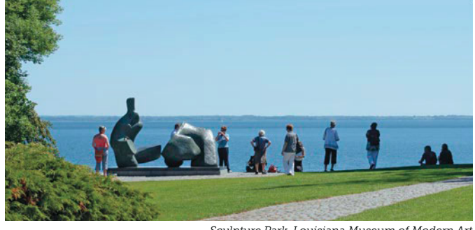
Sculpture Park, Louisiana Museum of Modern Art