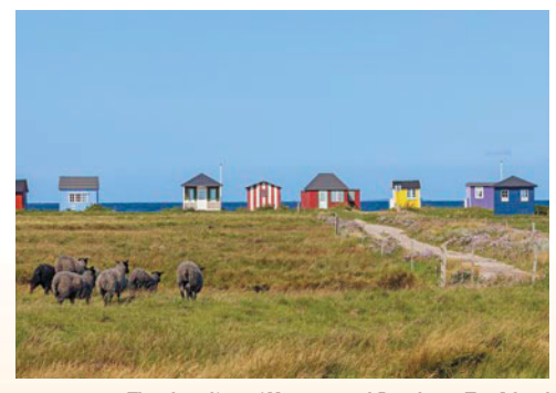
The shoreline of Vesterstrand Beach on Ærø Island is dotted with charming, traditional beach huts, treasured properties that are often handed down from generation to generation.

Silkeborg. Take a guided walk in this vibrant town nestled in Denmark's lush Lake District, and visit the Silkeborg Museum, notable for the remarkably well-preserved Tollund Man and Elling Woman from the fifth century B.C. Savor smørrebrød, traditional Danish openfaced sandwiches, for lunch at a restaurant.