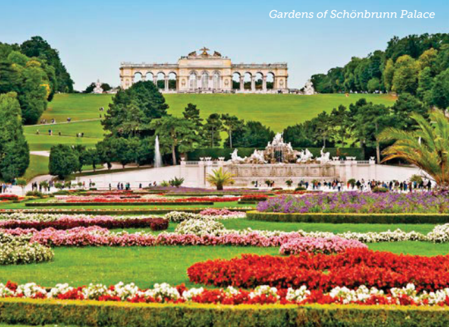
Gardens of Schönbrunn Palace