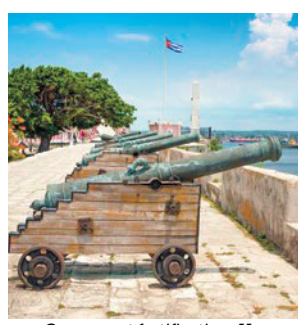
Cannons at fortification, Havana