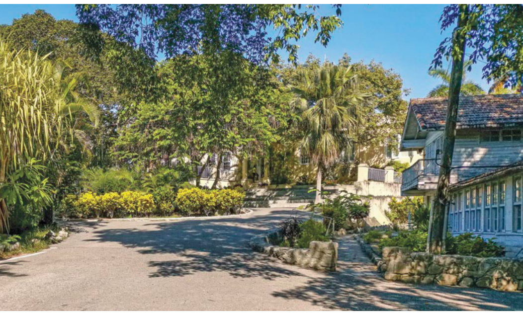
La Finca Vigia museum, Ernest Hemingway's home