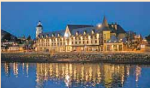
Hotel Costaustralis | Puerto Natales