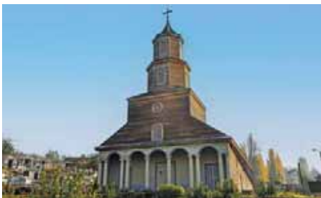
Ecclesiastical wooden architecture, Chiloé