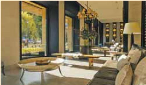
Hotel Cabo de Hornos | Punta Arenas