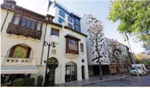
Hotel Cumbres Lastarria | Santiago