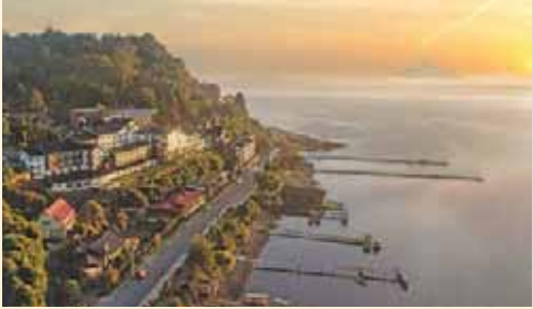
Hotel Cabaña del Lago | Puerto Varas