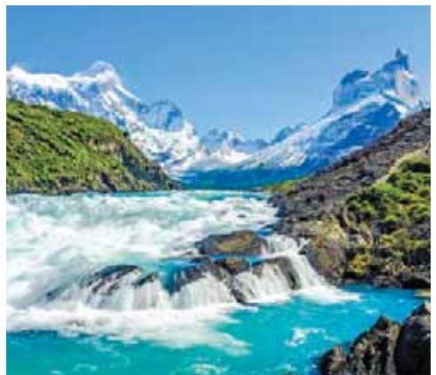
Salto Grande waterfall, Torres del Paine