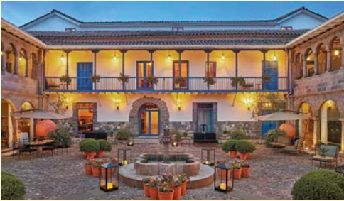
Palacio del Inka | Cusco