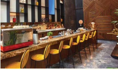
Pullman Lima Miraflores | Lima