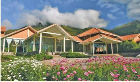
Casa Andina Premium Valle Sagrado | Sacred Valley