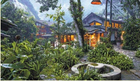
Inkaterra Machu Picchu Pueblo | Machu Picchu