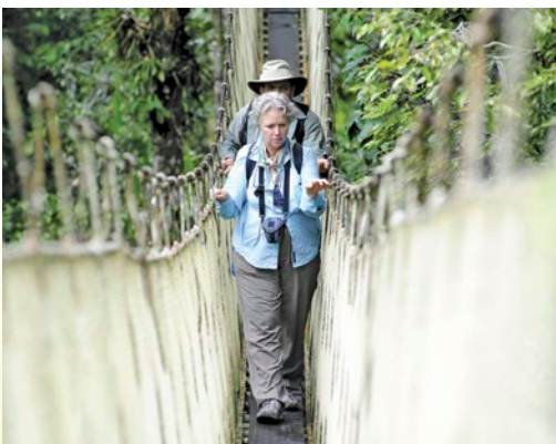
Rain forest hike