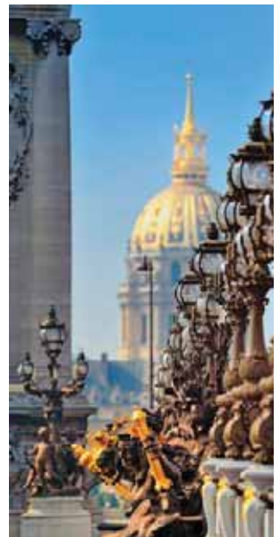
Pont Alexandre III

Knowledgeable Lecturers deepen your appreciation for the region and its history, culture and current events.