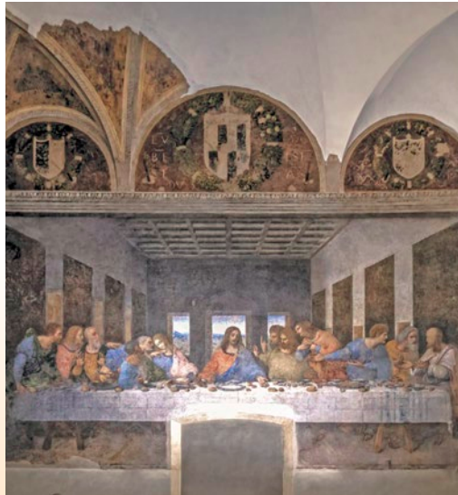
Leonardo da Vinci's "The Last Supper"