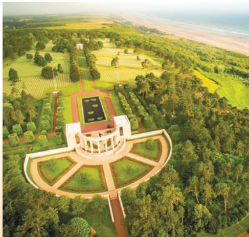
Normandy American Cemetery

Normandy & D-Day. Journey into World War II history at Pointe du Hoc. It was here that U.S. Rangers scaled cliffs to destroy German artillery emplacements that posed a threat to troops landing on Omaha and Utah beaches. Learn about this treacherous mission from your guide. At Omaha Beach, contemplate the bravery of the Allied landing forces who advanced under devastating fire across the heavily fortified shoreline to overcome German troops. Next, visit the Normandy American Cemetery, which contains 9,385 graves of Americans who died in the invasion and subsequent battles, followed by a touching visit to the Caen Peace Memorial Museum.