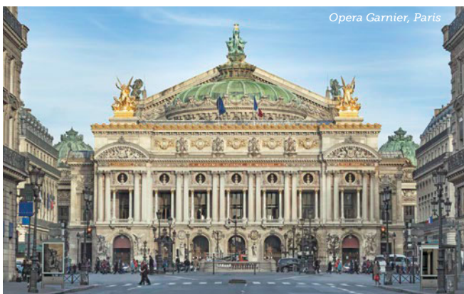
Opera Garnier, Paris