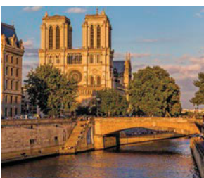
Notre Dame, Paris