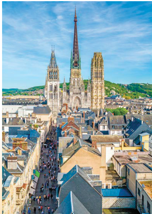
Notre-Dame de Rouen