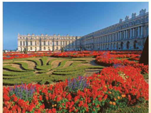
Gardens at Versailles