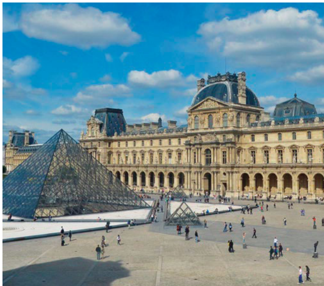
The Louvre, Paris