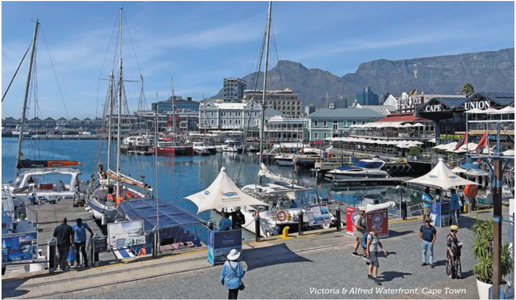
Victoria & Alfred Waterfront, Cape Town