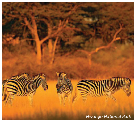
Hwange National Park

This morning, depart for the train station in