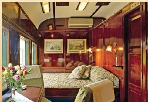
Deluxe Suite with a double bed and a lounge area

Discover the glamour of the Golden Age of train travel aboard the luxurious Rovos Rail. Ride in vintage carriages, restored to mint condition and impeccably appointed. Spend your days in the Observation Car or mingle with fellow travelers in the lounge. Expertly prepared cuisine showcases local ingredients and regional specialties, and all beverages are included. Each morning, take in the scenic splendor of the passing landscapes during a sumptuous breakfast. Three-course lunches and dinners, announced by a gong, include a selection of South African wines.