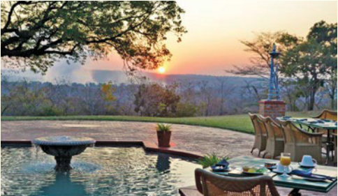
The Victoria Falls Hotel | Victoria Falls