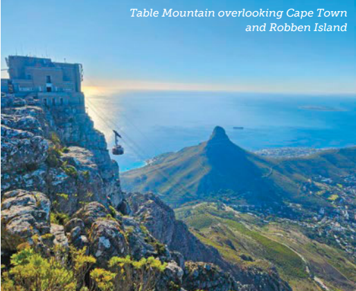
Table Mountain overlooking Cape Town and Robben Island