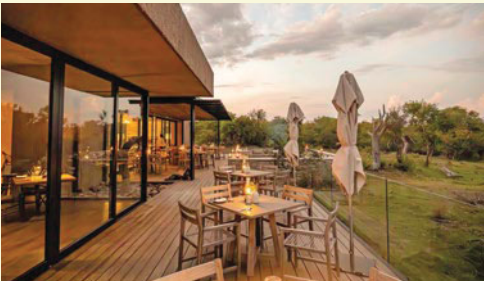
Kapama River Lodge | Kapama Game Reserve