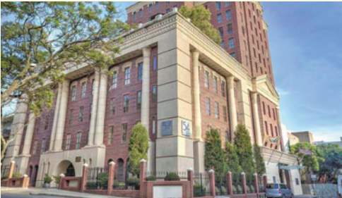
54 on Bath | Johannesburg