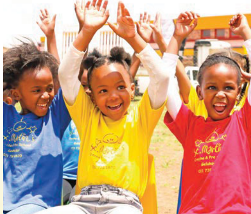
Youth of Soweto