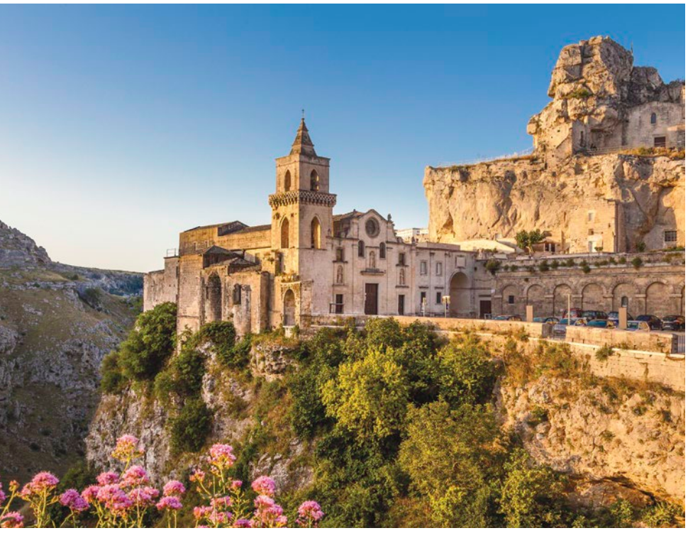
Sassi di Matera

Trani. Explore the historic seaport of Trani. Known for its Moscato di Trani wine and savory figs, this fishing town is home to a 13th-century fort and a cathedral nestled in the harbor of the Adriatic. Take note of the distinguishing Norman houses, a typically English-Romanesque style of architecture.