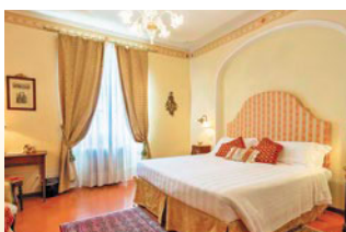
Villa Marsilli | Cortona