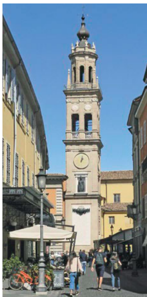
Clock tower, Parma

Knowledgeable Lecturers deepen your appreciation for the region and its history, culture and current events.