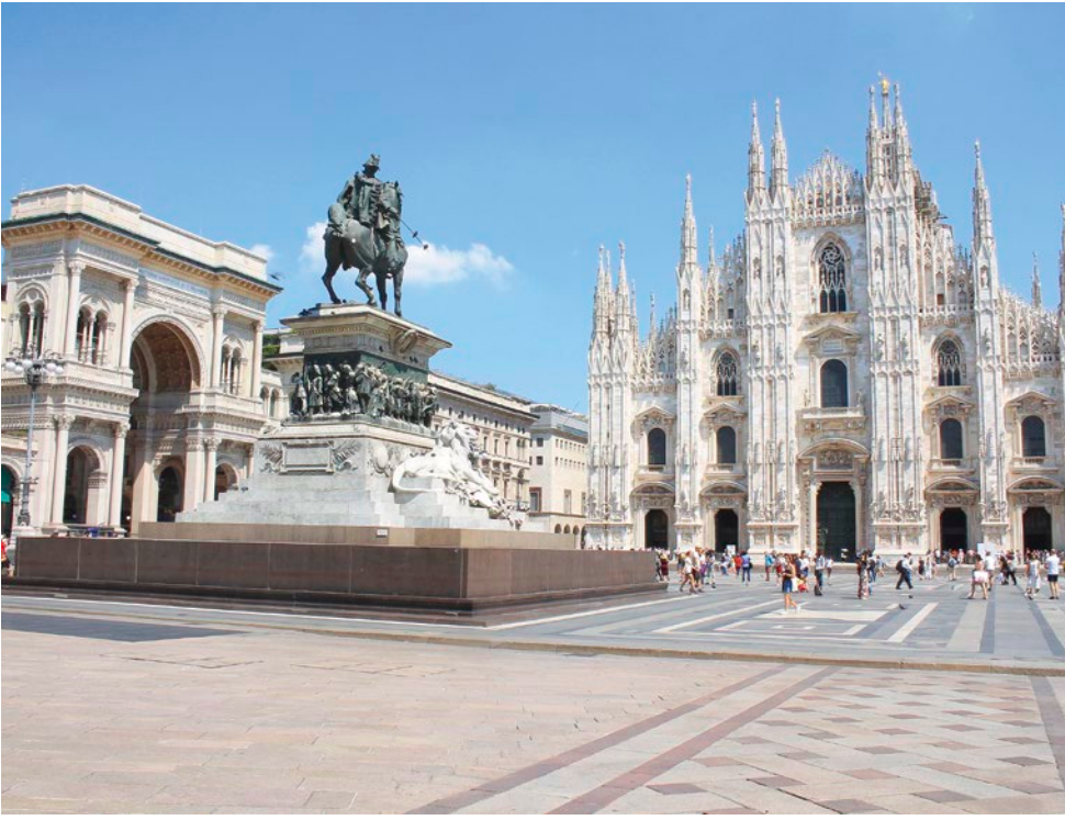
Piazza del Duomo. Milan

Cruising Lake Como. Travel by private boat from Bellagio to Como, one of the most romantic ways to experience this region. Glide on deep-blue water, gloriously bathed with rays of sunlight, and delight in views of villas and colorful villages. Vistas of stunning gardens, hidden waterfalls and cypress groves will captivate your senses while the majestic Alps stand sentry from afar. Upon arrival in Como, join your guide for a walking tour. Pass by Piazza Cavour, viewing the elegant gardens and the historic Teatro Adriano.