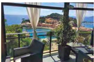
Hotel Vis a Vis | Sestri Levante