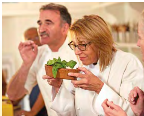
Italian cooking lesson

Cinque Terre. Few places will touch your heart like this patchwork of villages tumbling to the