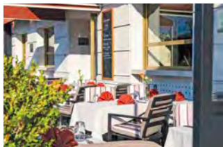
Hotel Aston La Scala | Nice