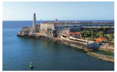
La Cabaña fortress, Havana harbor

The association is a huge proponent of continuing education and there is no better classroom than our world. Experience rich history and culture in the company of your fellow Longhorns! Are you ready for the adventure of a lifetime? We're standing by to answer all of your questions and/or take your reservation. Capacity is limited on this popular program and it may sell out quickly. Please contact the Flying Longhorns travel office at 800-594-3900 or travel@texasexes.org with questions or to make a reservation.