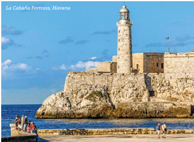
La Cabaña Fortress, Havana