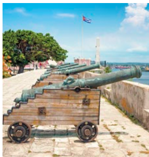
Cannons at fortification, Havana